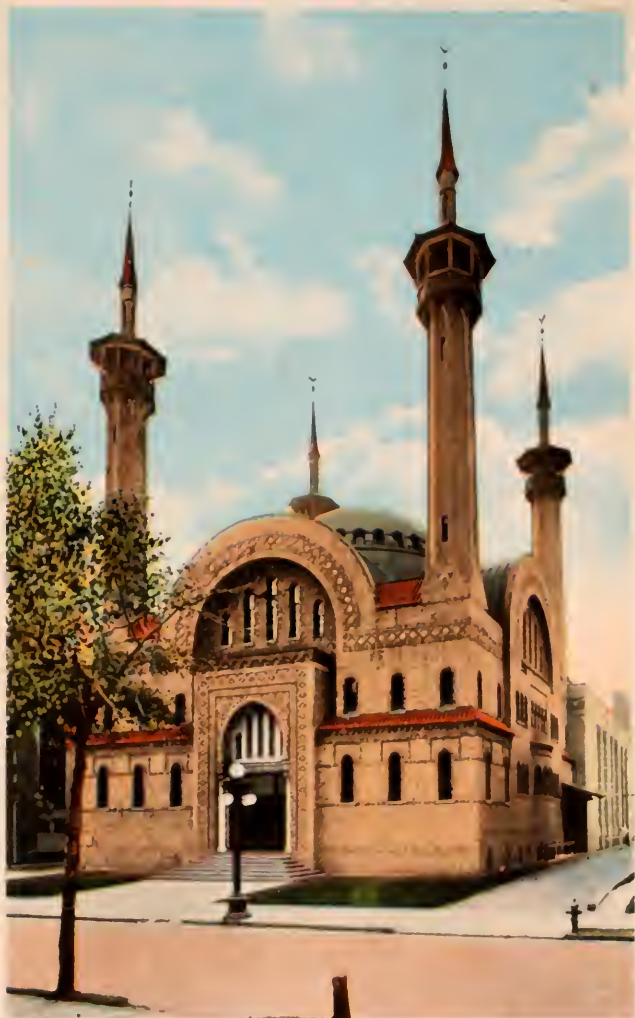
IREM TEMPLE, WILKES-BARRE, PA.